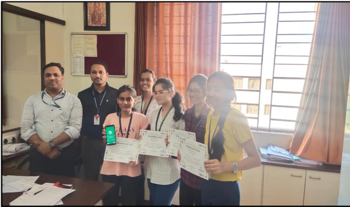
SE Student's Won 1 st prize in Hustle Hunt at "TECHNOWAVW 2K23"